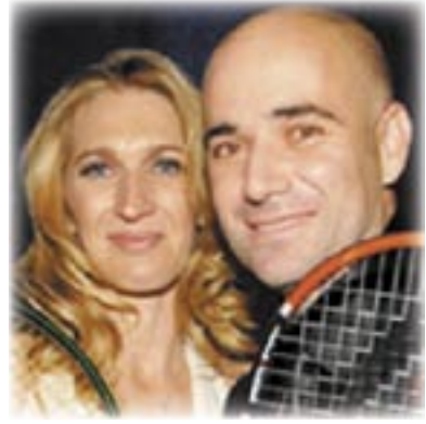
Steffi Graf and Andre Agassi were the first married couple to have won both the men’s and women’s singles Wimbledon Championships.

At the Farm, we laugh in the face of Old Man Winter, scoff at wind chills, and dare that freezing weather to try and stop us from getting our tennis in. Those of you who have braved the cold will reap the benefits come Spring, which is slowly approaching. This Spring, we are offering more programs than ever, so no matter what level you are, or what time you can come out, there is something for you. If you don’t want to wait for the courts to thaw, the Valentine’s Day mixer is right around the corner! One of the most exciting new programs coming to the Farm this Spring is Quickstart Tennis – the best way to introduce your young one to the sport. We’re looking forward to that first day of Spring and the return of the masses to the courts. See you then!